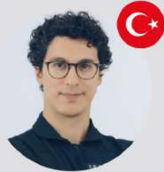
Tuva Cihangir Atasever Astronaut in training, Turkish Space Agency