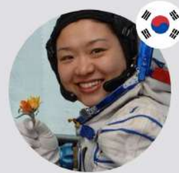
So-yeon Yi Astronaut, KARI (ret.)